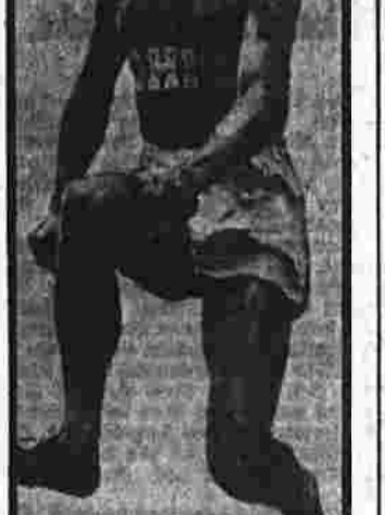
Jesse Owens usually is snappy sprinting. Margaret Bourke-White shoots him broad jumping for a change.